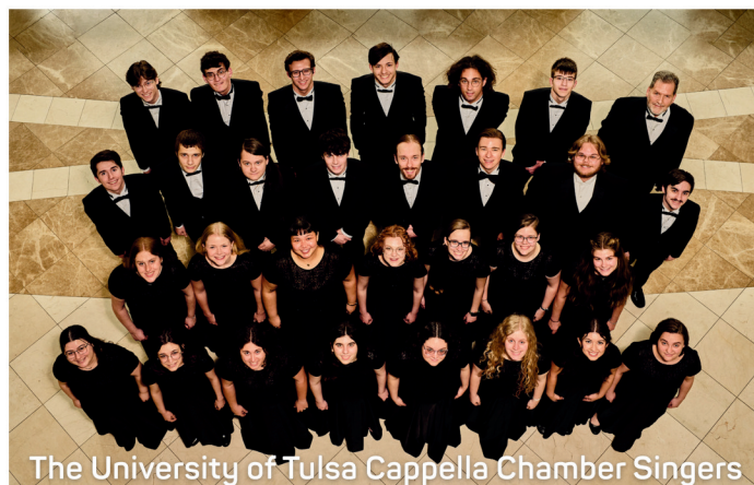
The University of Tulsa Cappella Chamber Singers