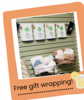
Free gift wrapping!