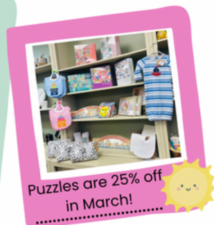
Puzzles are 25% off in March!