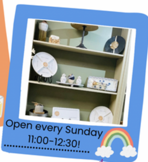
Open every Sunday 11:00-12:30!