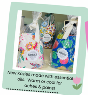
New Kozies made with essential oils. Warm or cool for aches & pains!