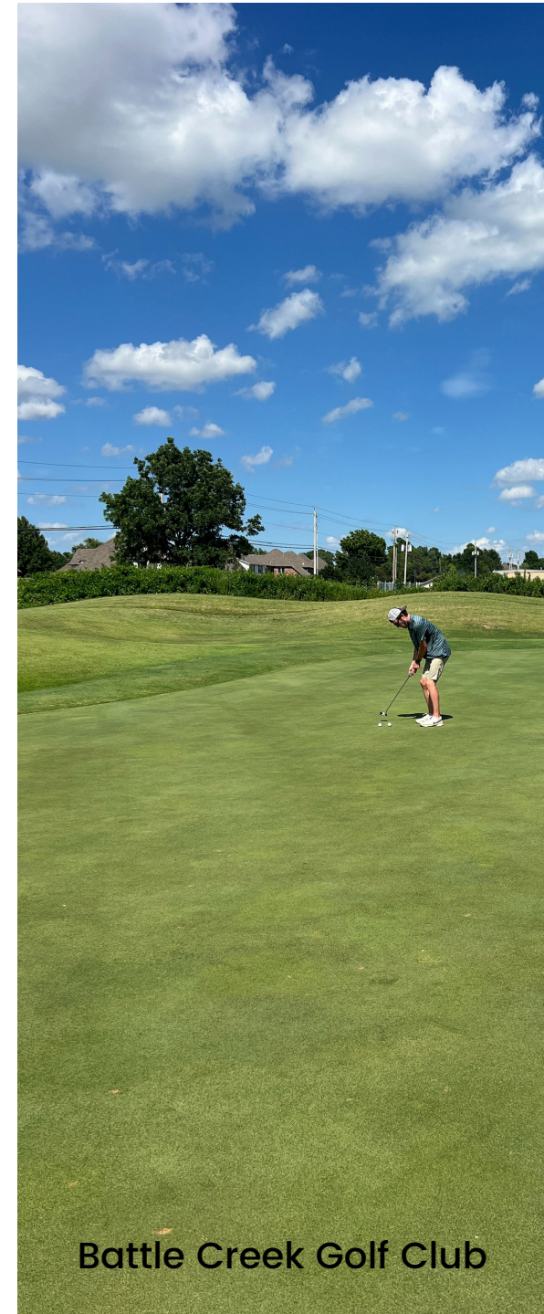
Battle Creek Golf Club