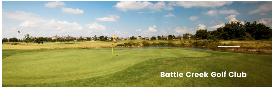
Battle Creek Golf Club